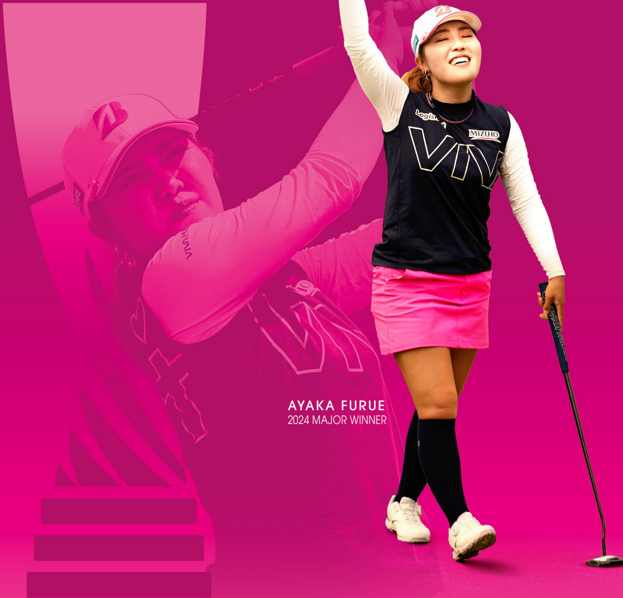
AYAKA FURUE 2024 MAJOR WINNER