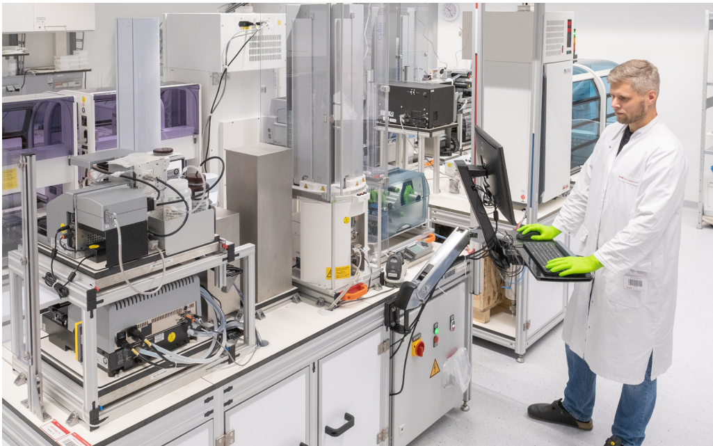
Analysing tissue characteristics (HLA) in our labs

The patient's doctor will look for a matching donor within the patient's family first. However, about 70% of patients who need a transplant do not find a suitable donor within their family. In these cases, the patient's doctor will search for an unrelated adult donor.