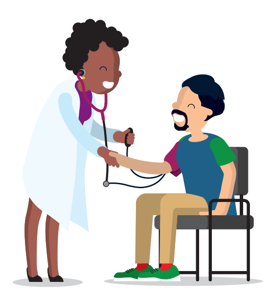
Page 24 of 26 Effective Date: 20250509 ZA CT IN 02 Donor Handbook V6

Read more at https://www.cdc.gov/parasites/toxoplasmosis/gen info/fags.html