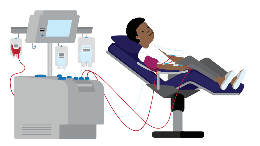
Page 11 of 26 Effective Date: 20250509 ZA CT IN 02 Donor Handbook V6