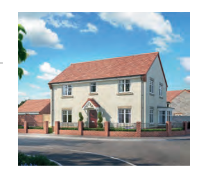
4 bedroom house 1,408 sq ft.