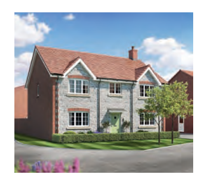
4 bedroom house 1,785sq ft.