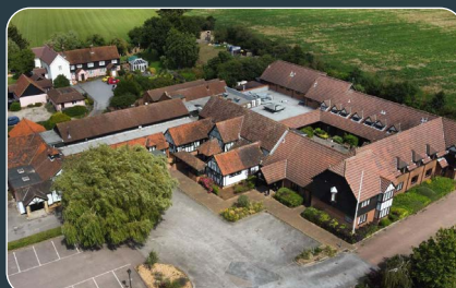
CHICHESTER HOTEL ESSEX