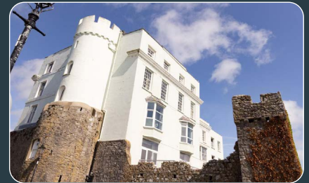
IMPERIAL HOTEL TENBY PEMBROKESHIRE