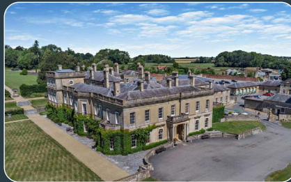
HARTHAM PARK WILTSHIRE