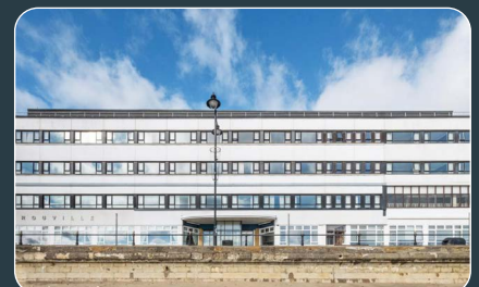
TROUVILLE HOTEL ISLE OF WIGHT