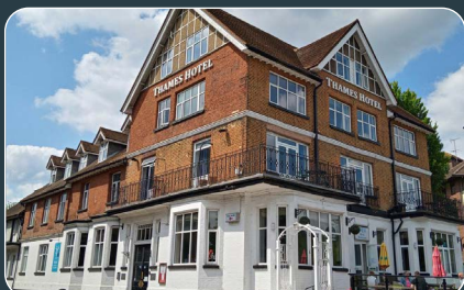
THAMES HOTEL BERKSHIRE