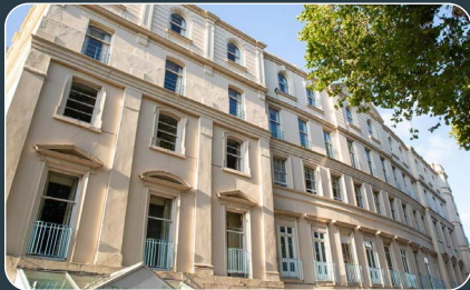
TORBAY HOTEL DEVON