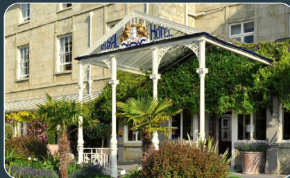
ROYAL HOTEL ISLE OF WIGHT