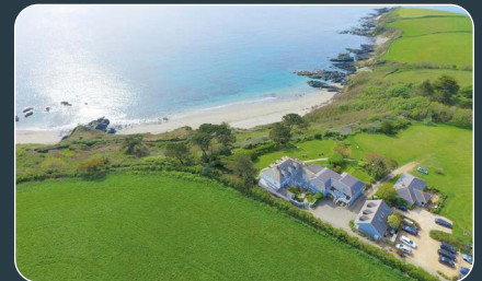
DRIFTWOOD HOTEL CORNWALL