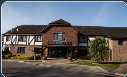
CROWNE PLAZA FELBRIDGE WEST SUSSEX