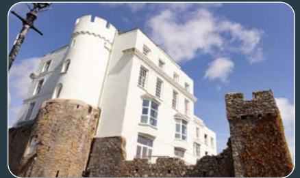
IMPERIAL HOTEL TENBY PEMBROKESHIRE