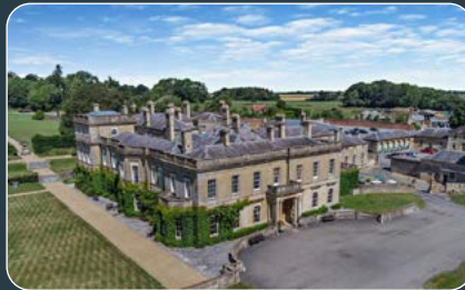
HARTHAM PARK WILTSHIRE