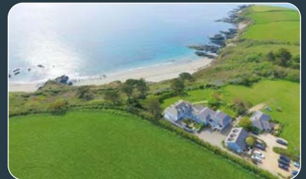
DRIFTWOOD HOTEL CORNWALL