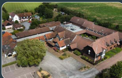
CHICHESTER HOTEL ESSEX