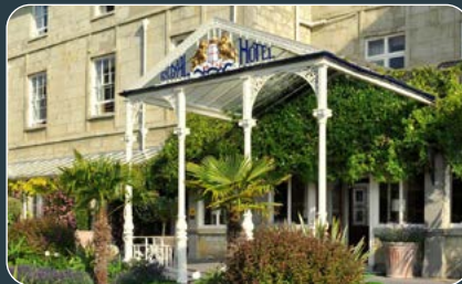
ROYAL HOTEL ISLE OF WIGHT