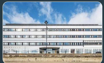
TROUVILLE HOTEL ISLE OF WIGHT