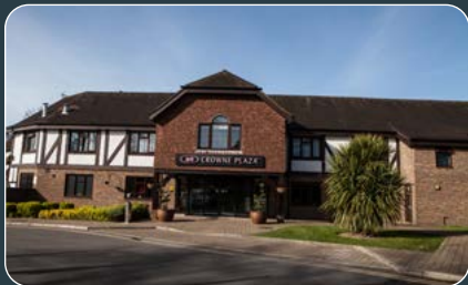
CROWNE PLAZA FELBRIDGE WEST SUSSEX