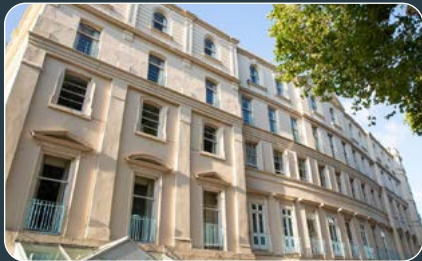
TORBAY HOTEL DEVON