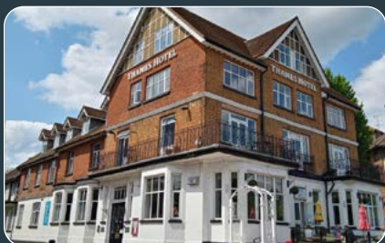
THAMES HOTEL BERKSHIRE