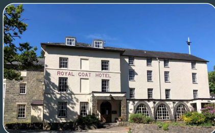
ROYAL GOAT HOTEL NORTH WALES