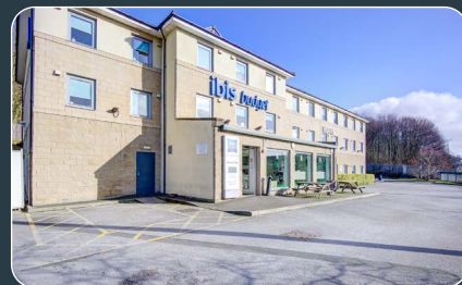
IBIS BUDGET BRADFORD WEST YORKSHIRE