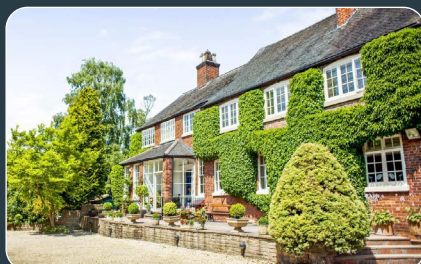
NETHERSTOWE HOUSE STAFFORDSHIRE