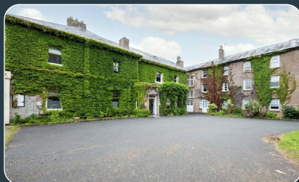
ST. ANDREWS TOWN HOTEL WORCESTERSHIRE