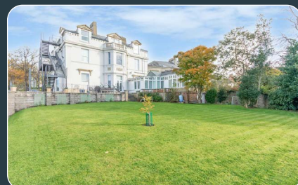
CHASE HOTEL CUMBRIA