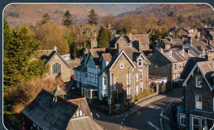
GABLES GUEST HOUSE CUMBRIA