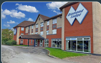
DIAMOND LODGE MANCHESTER