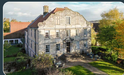
HELLABY HALL HOTEL SOUTH YORKSHIRE