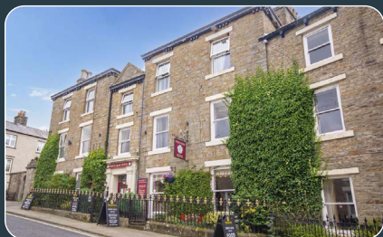
WHITE ROSE HOTEL NORTH YORKSHIRE