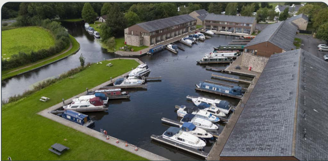
TEWITFIELD MARINA HOLIDAY APARTMENTS & MOORINGS