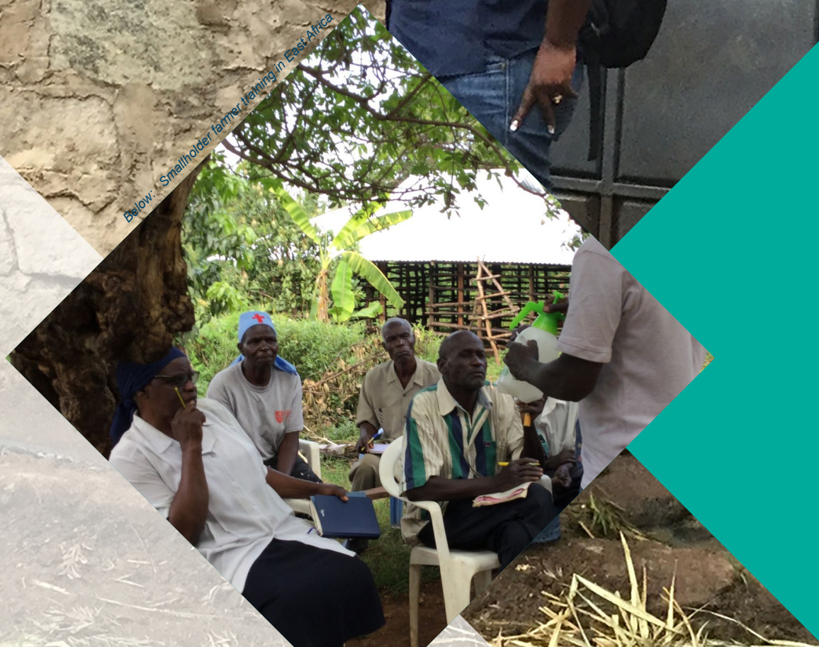
Below: Smallholder farmer training in East Africa

Livestock disease is a significant threat to achieving food security globally. In East Africa, 25 percent of livestock currently raised are lost due to animal illness. 4 Launched in 2017 with a $3.1 million grant from the Bill & Melinda Gates Foundation®, our EAGA shared value initiative aims to empower farmers with the knowledge and medicine they need to care for animals and enable the growth of their communities, reducing animal mortality and poverty, increasing farmer's income and improving diets and health of local families.