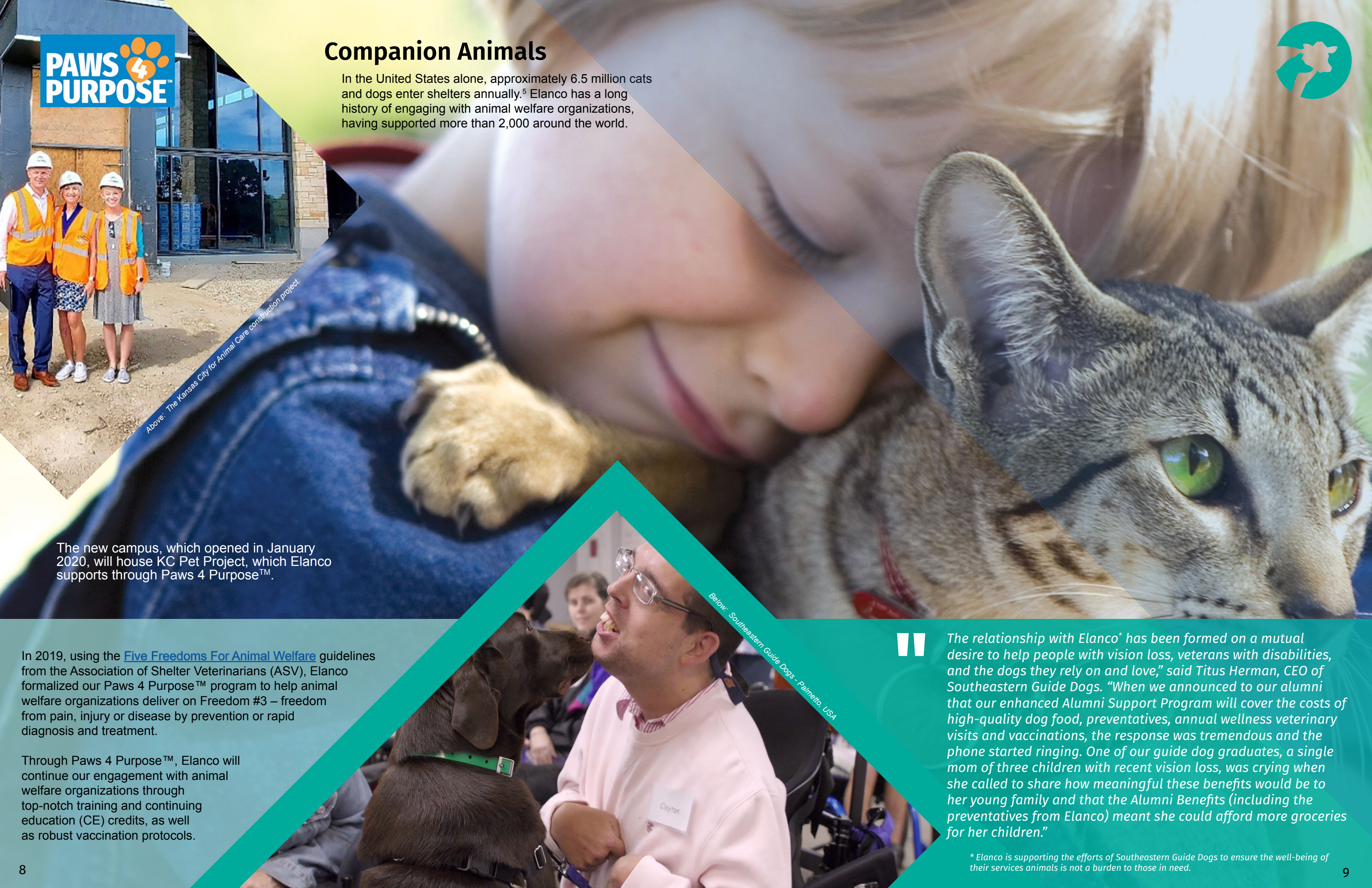
Above: The Kansas City for Animal Care construction project.

The new campus, which opened in January 2020, will house KC Pet Project, which Elanco supports through Paws 4 Purpose™.