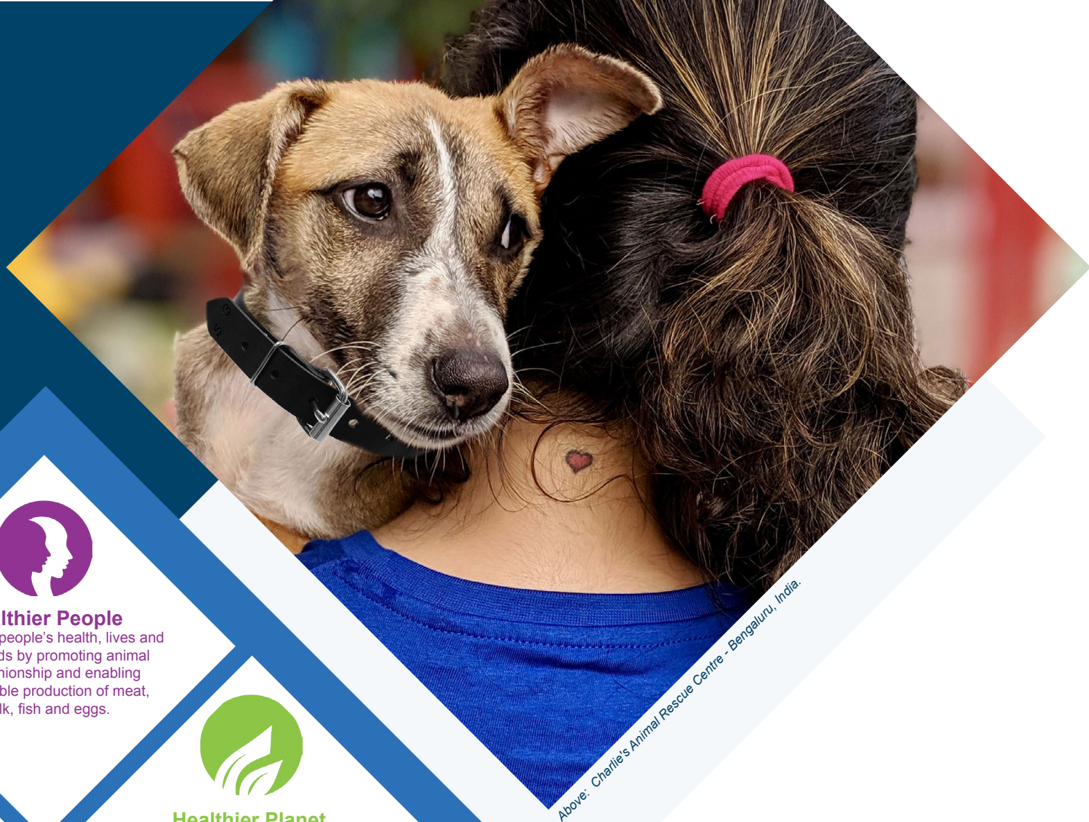
Above: Charlie's Animal Rescue Centre - Bengaluru, India.