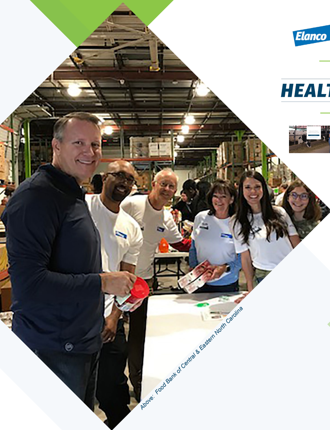
Above: Food Bank of Central & Eastern North Carolina