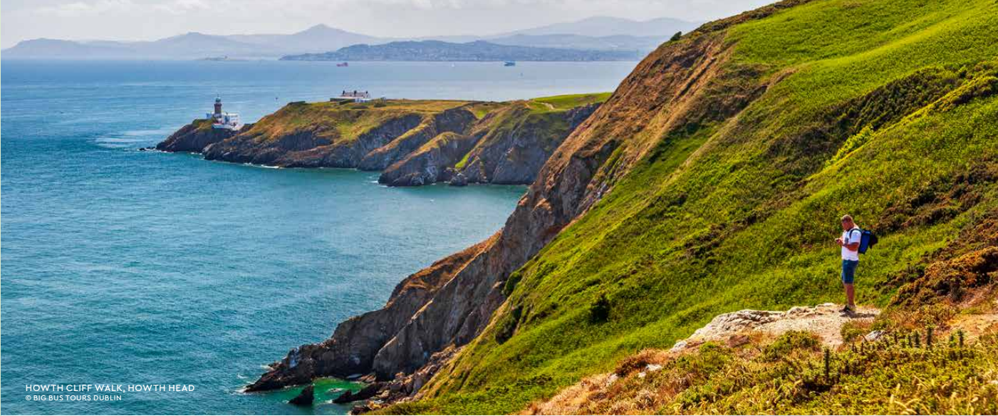
HOWTH CLIFF WALK, HOWTH HEAD

Venture closer to the sea and discover Dublin's beautiful bay, lined with beautiful beaches, pretty villages and wonderful seaside walks. Follow the Dublin Coastal Trail, stretching from Skerries to Killiney to enjoy the stunning coastline and diverse ecology that has earned the bay the title of UNESCO Biosphere. Whether it's a stroll down the beach at Killiney, a dip at the Forty Foot in Sandycove or a hike along Howth Head, the fresh sea air is sure to rejuvenate the soul. If you're up for a more challenging trek, the Dublin Mountains fringe the southern side of the city, leading up into County Wicklow and the long-distance Wicklow Way.