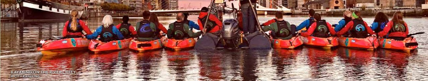
KAYAKING ON THE RIVER LIFFEY

Portobello Running along the edge of the Grand Canal, between Rathmines and Camden Street, Portobello is great for waterside lunches.