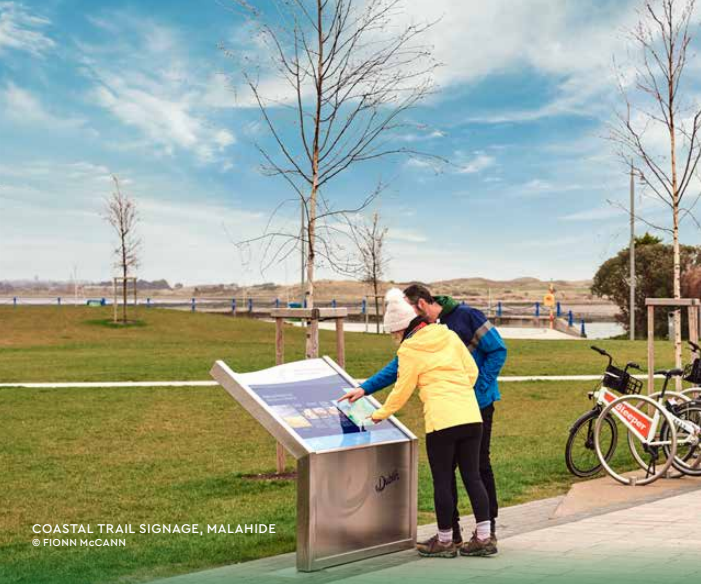
COASTAL TRAIL SIGNAGE, MALAHIDE