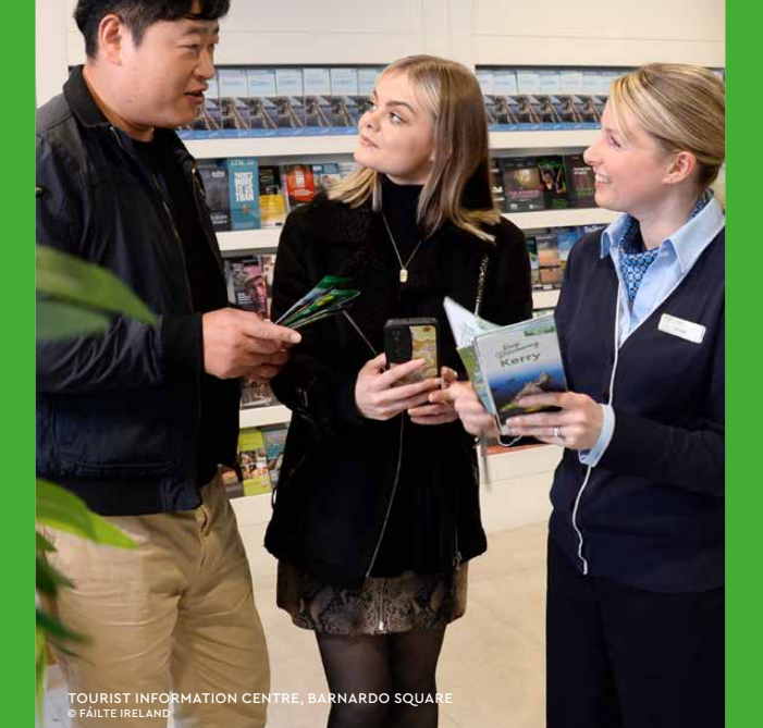
TOURIST INFORMATION CENTRE, BARNARDO SQUARE

For more great things to see and do in Dublin, visit www.VisitDublin.com or scan this QR code: