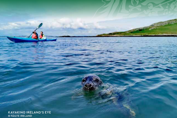
KAYAKING IRELAND'S EYE

Stunning sea views, thrilling water based activities, the freshest sea food, incredible activities and experiences await you along the Dublin Coastal Trail. For further information go to www.visitdublin.com