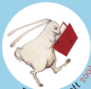
Emily Gravett 2004