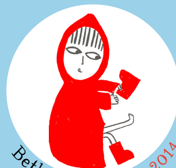
Bethan Woollvin 2014