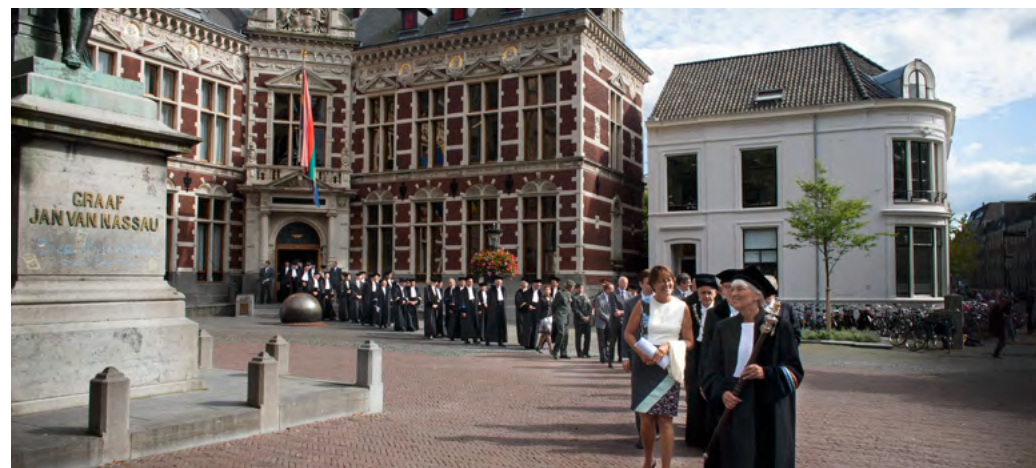
University Hall, Dies Natalis, Inner City