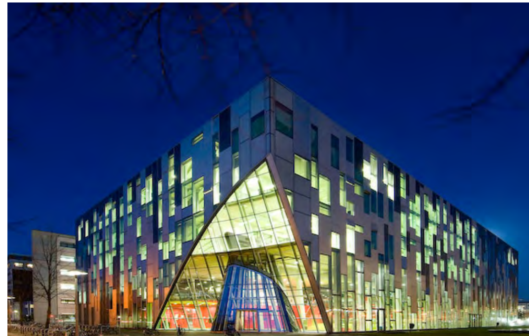
Hijmans van den Berghgebouw