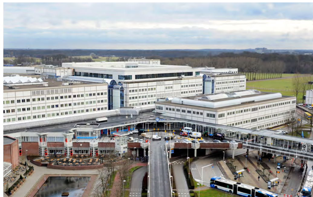
UMC Utrecht De Uithof

International Service Desk can help you with all your questions about your visa and housing, and anything to do with taxes, pension and living in the Netherlands (including your family). If you have questions about your contract, salary and terms of employment (e.g. the flexible terms of employment, referred to collectively as the 'CAO a la Carte'), you can contact The HRM Service Centre. Please find an overview of the address of HRM Service Centre at the end of this brochure of UMC Utrecht.