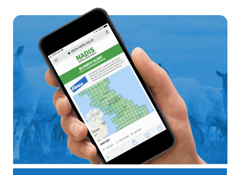
NADIS forecast - View risk alerts

For further information call Elanco Animal Health on +44 (0)1256 353131, or write to Elanco Animal Health, Lilly House, Priestley Road, Basingstoke, Hampshire, RG24 9NL