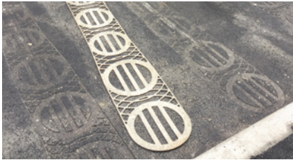
Step 1: Prepare