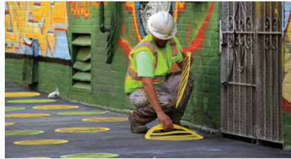
Step 2: Position