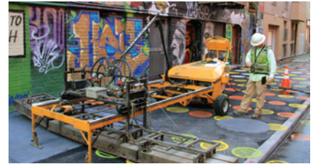
Step 3: Heat