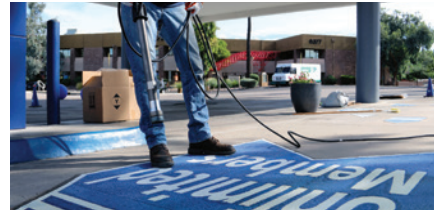
Step 3: Heat