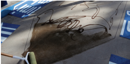
Step 1: Prepare

We can also train your employees in proper application techniques. For more information, please contact your PPG sales representative.