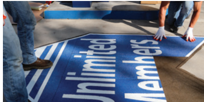
Step 2: Position