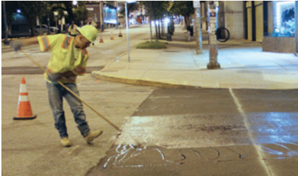
Step 1: Prepare

Need help? We can recommend certified applicators in your area or train your employees in proper application techniques. For more information, please contact your PPG sales representative.