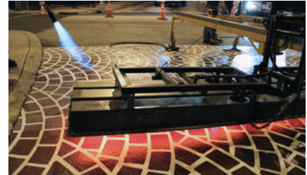
Step 3: Heat