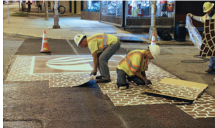
Step 2: Position