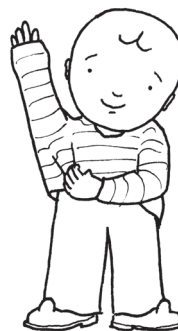
He puts on his pyjamas