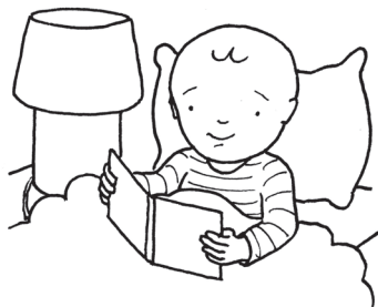
He reads his book