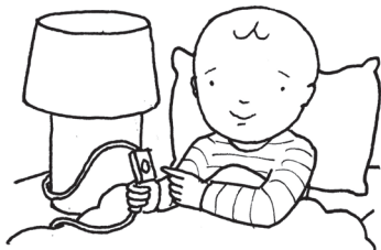
He switches off the light