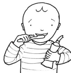
He brushes his teeth