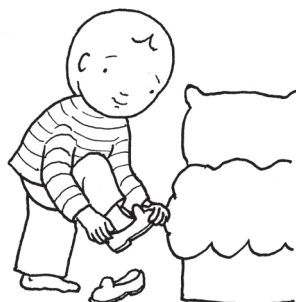
He takes off his slippers