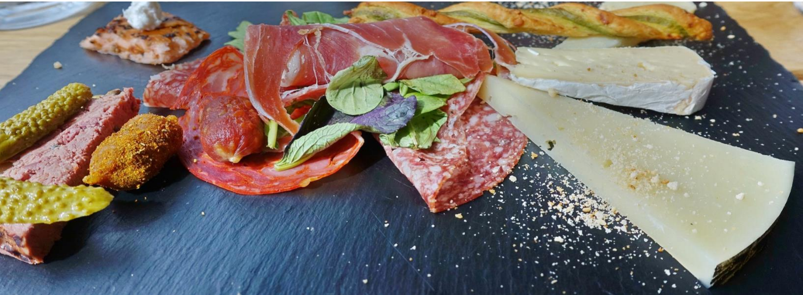
Tapas is a style of food that is commonly shared