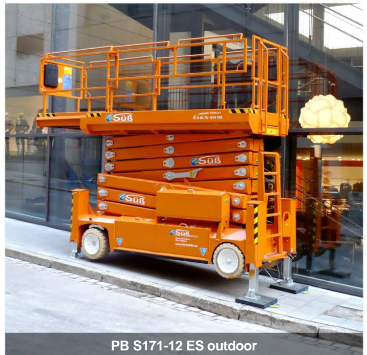
PB S171-12 ES outdoor