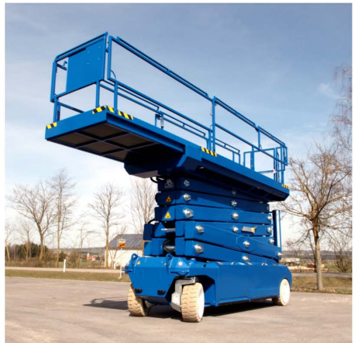
PB S195-12 E | 600kg platform capacity