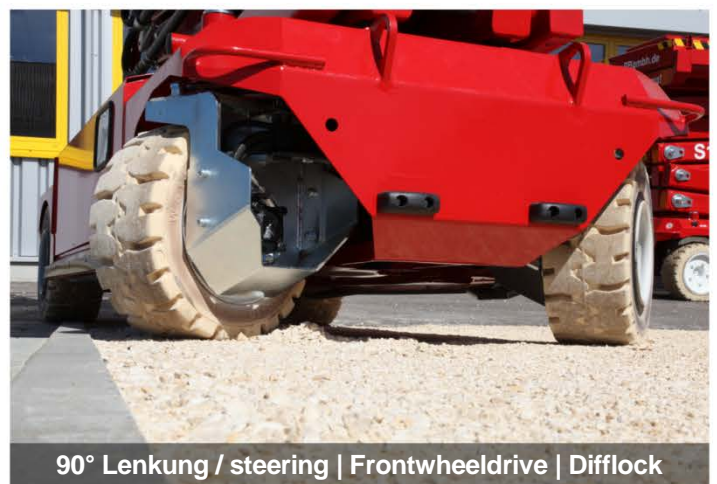
90° Lenkung / steering | Frontwheeldrive | Difflock