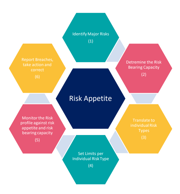
Figure 3 - Aegon Bank N.V.'s risk appetite process