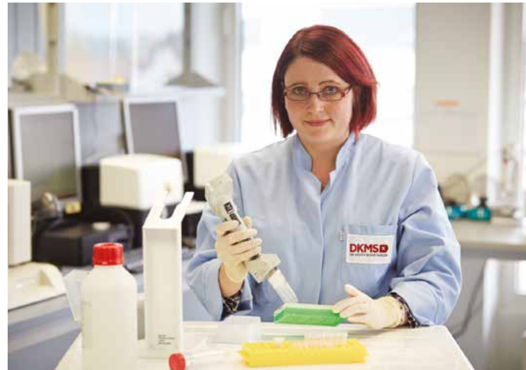
Analysing tissue characteristics (HLA) in our labs

The patient's doctor will look for a matching donor within the patient's family first. However, about 70% of patients who need a transplant do not find a suitable fully matched donor within their family. In these cases, the patient's doctor will search for an unrelated adult donor.