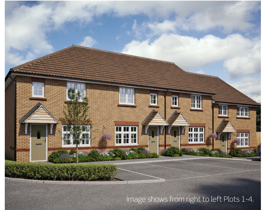
Image shows from right to left Plots 1-4.

Call 0300 330 0718 Visit sovereignliving.org.uk