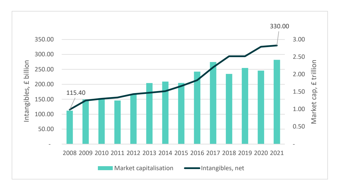
Figure 1: trend in intangible assets, FTSE 350 companies

Intangible assets figure excluding goodwill.