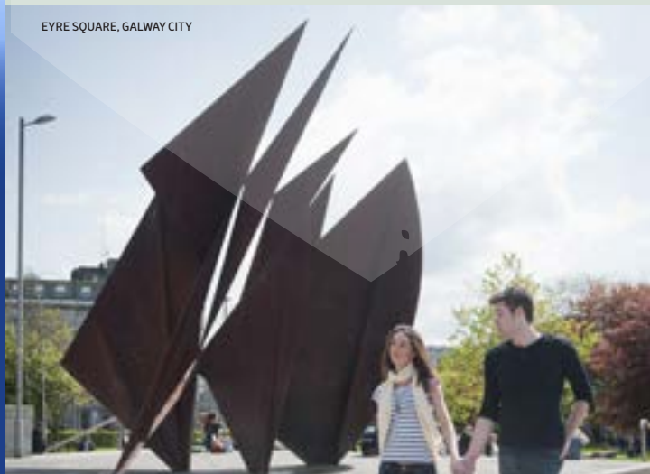
EYRE SQUARE, GALWAY CITY

East of Galway City and the shores of Lough Corrib is a different kind of landscape, a rich farming land that is dotted with handsome market towns and a fine collection of medieval monuments, like the 16 th -century Norman tower of Thoor Ballylee outside Gort and the magnificent castle in Atheny – monuments to a powerful past.