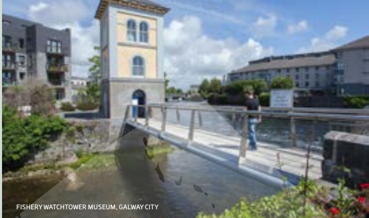
FISHERY WATCHTOWER MUSEUM, GALWAY CITY