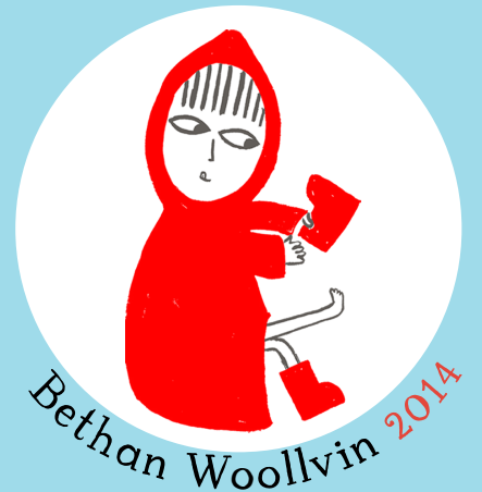
Bethan Woollvin 2014

Open to non-professional illustrators who are aged 18+ and UK residents