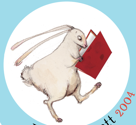
Emily Gravett 2004