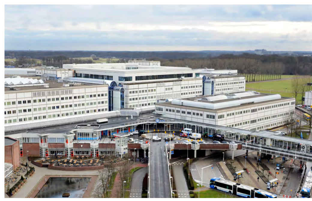
UMC Utrecht De Uithof

The International Service Desk can help you with all your questions about your visa, housing, and anything you and your family may have to deal with while living in the Netherlands. If you have questions about your contract (hospitality agreement) or your workplace, you can contact the HRM Service Centre of UMC Utrecht. You can find the address data of the HRM Service Centre at the end of this brochure.