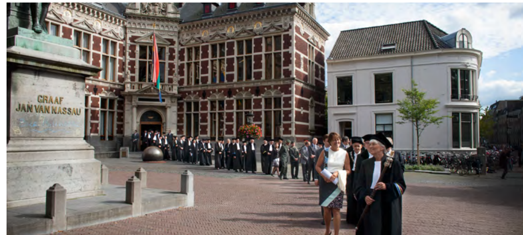
University Hall, Dies Natalis, Inner City