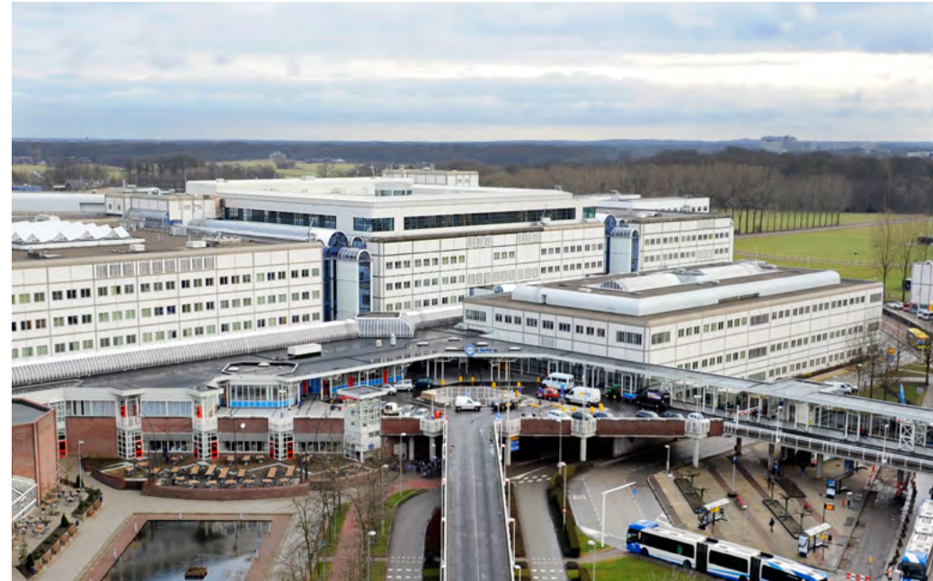
UMC Utrecht De Uithof

The International Service Desk can help you with all your questions about your visa, housing, and anything you and your family may have to deal with while living in the Netherlands. If you have questions about your contract (hospitality agreement) or your workplace, you can contact the HRM Service Centre of UMC Utrecht. You can find the address data of the HRM Service Centre at the end of this brochure.