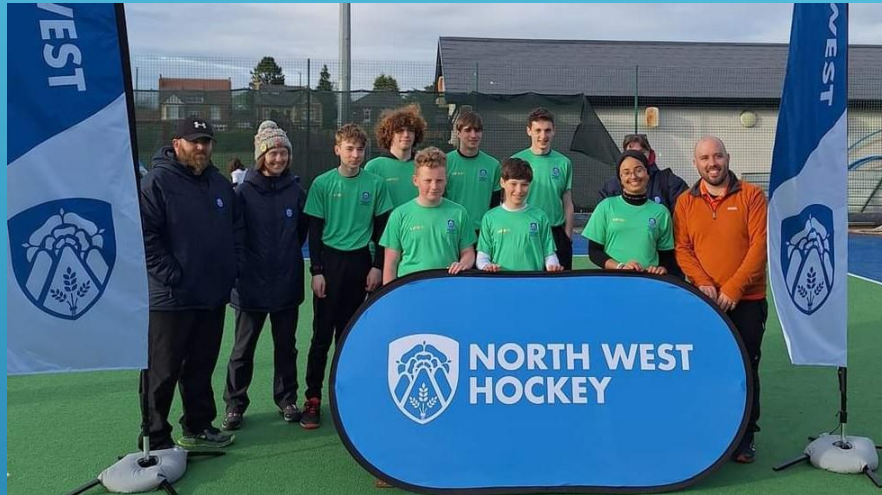
NW Young Umpire Challenge at the In2Hockey Finals