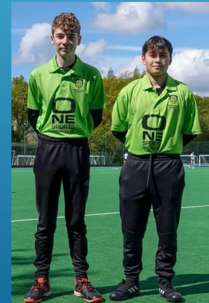
Junior U16 League Finals