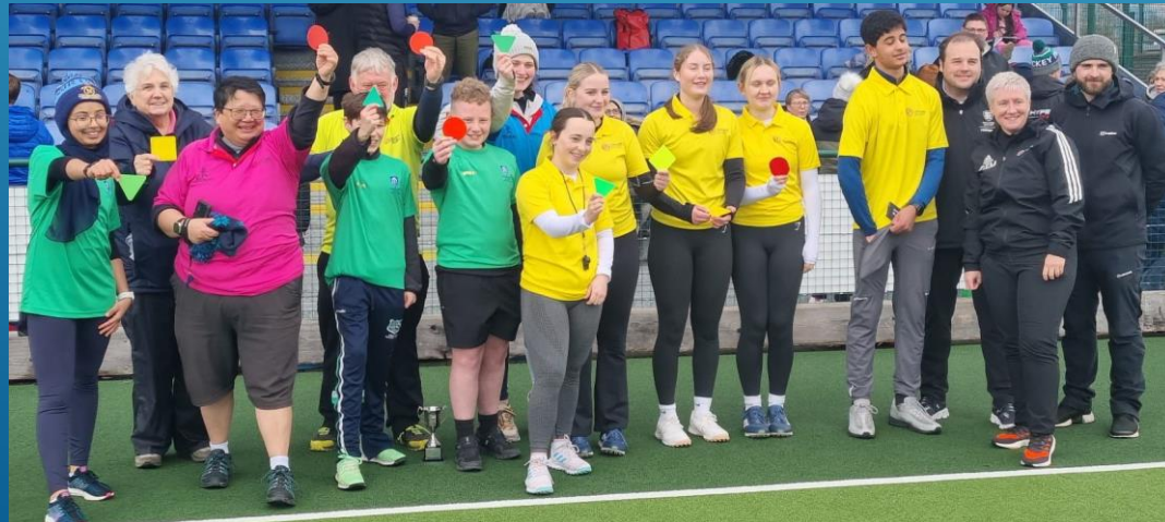
Lancashire In2 Hockey Young Umpires