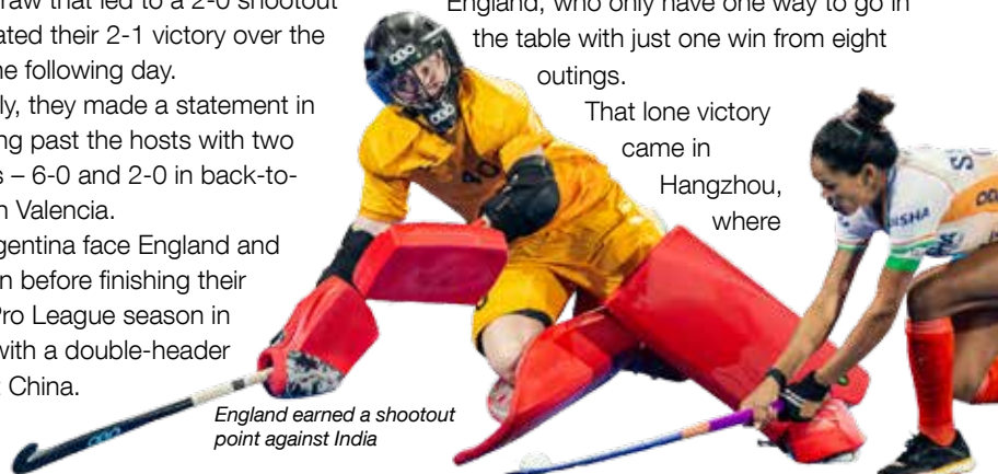
England earned a shootout point against India

That lone victory came in Hangzhou, where