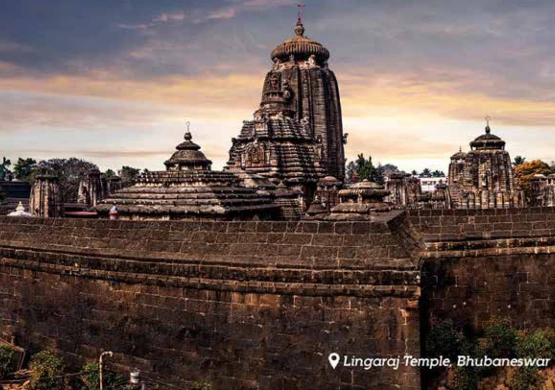
📍 Lingaraj Temple, Bhubaneswar