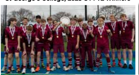
Yarm School. 2023 U18 T4 Winners