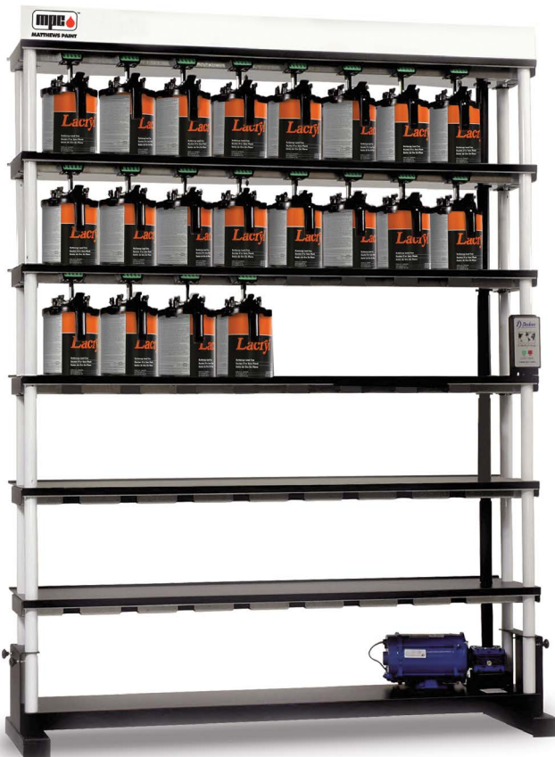
Dimensions: 87" H, 17.5" D, and 67" W

This translucent coating can be air sprayed to decorate back lit formed faces. Lacryl 400 can be matched to most popular brands.