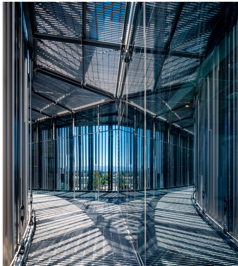
Viking Steel fabricated and installed the catwalk that connected the louvers to the curtain wall, an integral part of the facade assembly. R&B Protective Coatings finished it with the non-metallic zombie black coating.

With metallic pigments, colors with the same formulations can look quite different depending on the application process, method and equipment. This was the case with Thirty75.