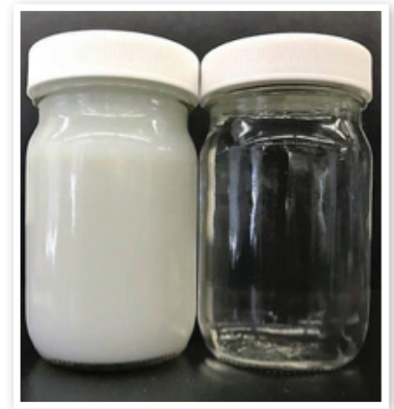
Figure 2 Comparison of Feed and Permeate Appearance

After the successful lab testing, the full scale system was installed in January 2018 in 14 of their 18 production lines. The elements have continued to perform at or above expectation for more than 14 months. The 4 remaining legacy systems will be converted to PPG UF membrane technology.