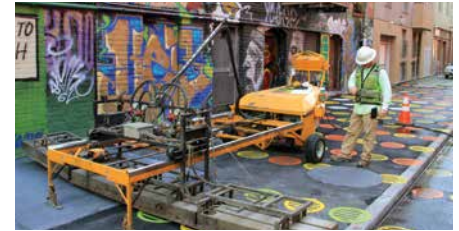
Step 3: Heat