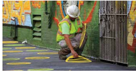
Step 2: Position