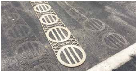
Step 1: Prepare