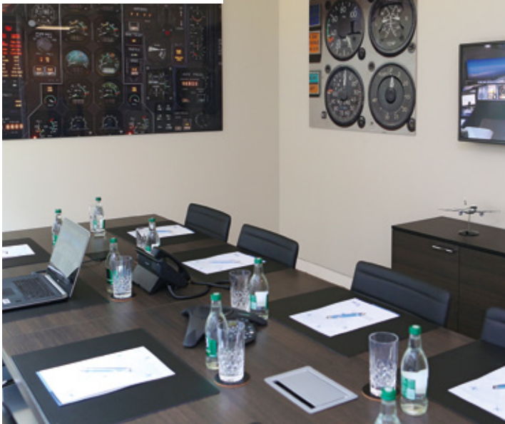
Fota | 8 Delegates