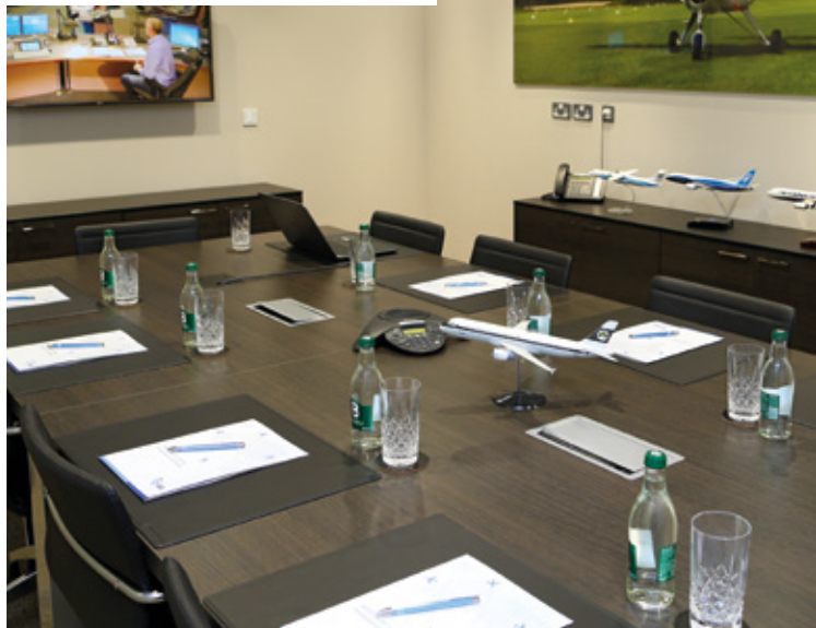
Lambay 1 | 10 Delegates