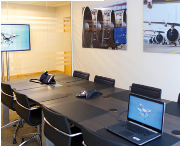
Inishtrahull | 8 Delegates