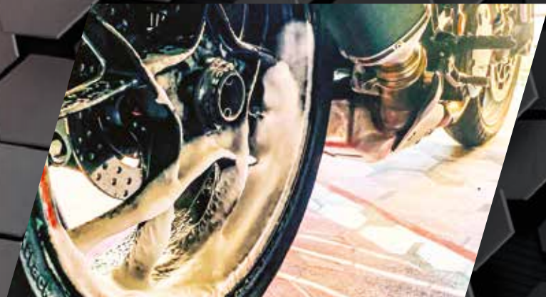
CHAMPION ProRacing GP Wheel Cleaner for rim cleaning.