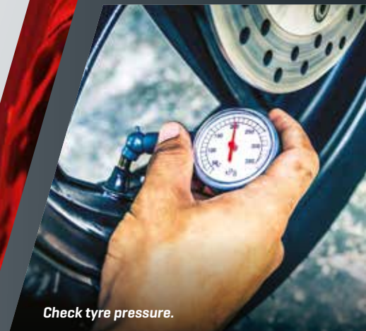
Check tyre pressure.

Mission accomplished? Now for some trail-blazing on your first trip of the season!