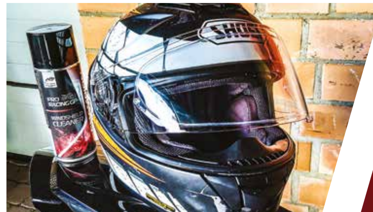
CHAMPION ProRacing GP Windshield Cleaner for helmet cleaning.

Your journey through the great outdoors will attract a build-up of dust, insect residue and other contaminants. The effective ProRacing GP Windshield Cleaner quickly cleans away dirt from the helmet and visor without leaving behind any residue, giving you peace of mind for optimal vision on your journey. Simply spray on from 20-30cm, leave briefly to allow the cleaner to take effect, then rub off with a microfibre cloth.