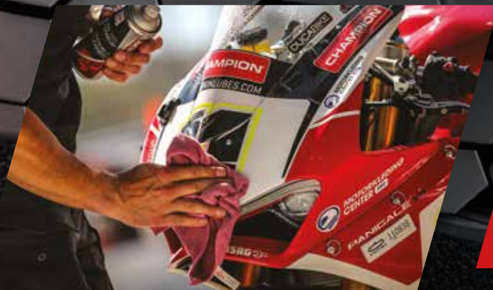
Clean the windshield with CHAMPION ProRacing GP Windshield Cleaner.

Outdoor adventures can attract unwanted insects on the front of your bike which leave behind sticky residue. Improve visibility with the CHAMPION ProRacing GP Windshield Cleaner, a foam cleaner that completely clears your windshield, visor and even the exterior of your helmet.